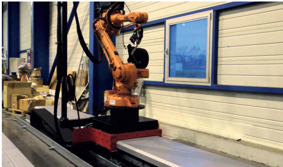
Caption 2: LUCAS offers with its linear axes for robot technology to offer comprehensive toolbox for integrators of robotics: Ratio axes, linear modules with two, three and four axes as well as swings

This press release and accompanying images are available for download from our website: www.cadenas.de/press/press-releases